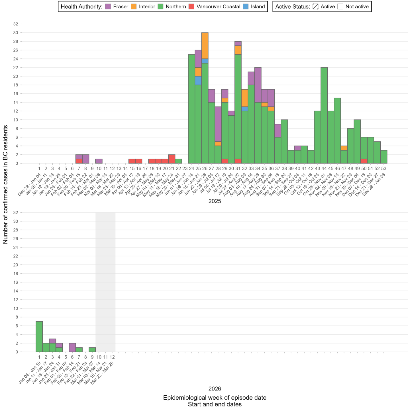
Figure 1. Epidemic curve of confirmed measles cases reported in BC by RHA and active status, 2025 and 2026

Total count = 429 cases reported in British Columbia.