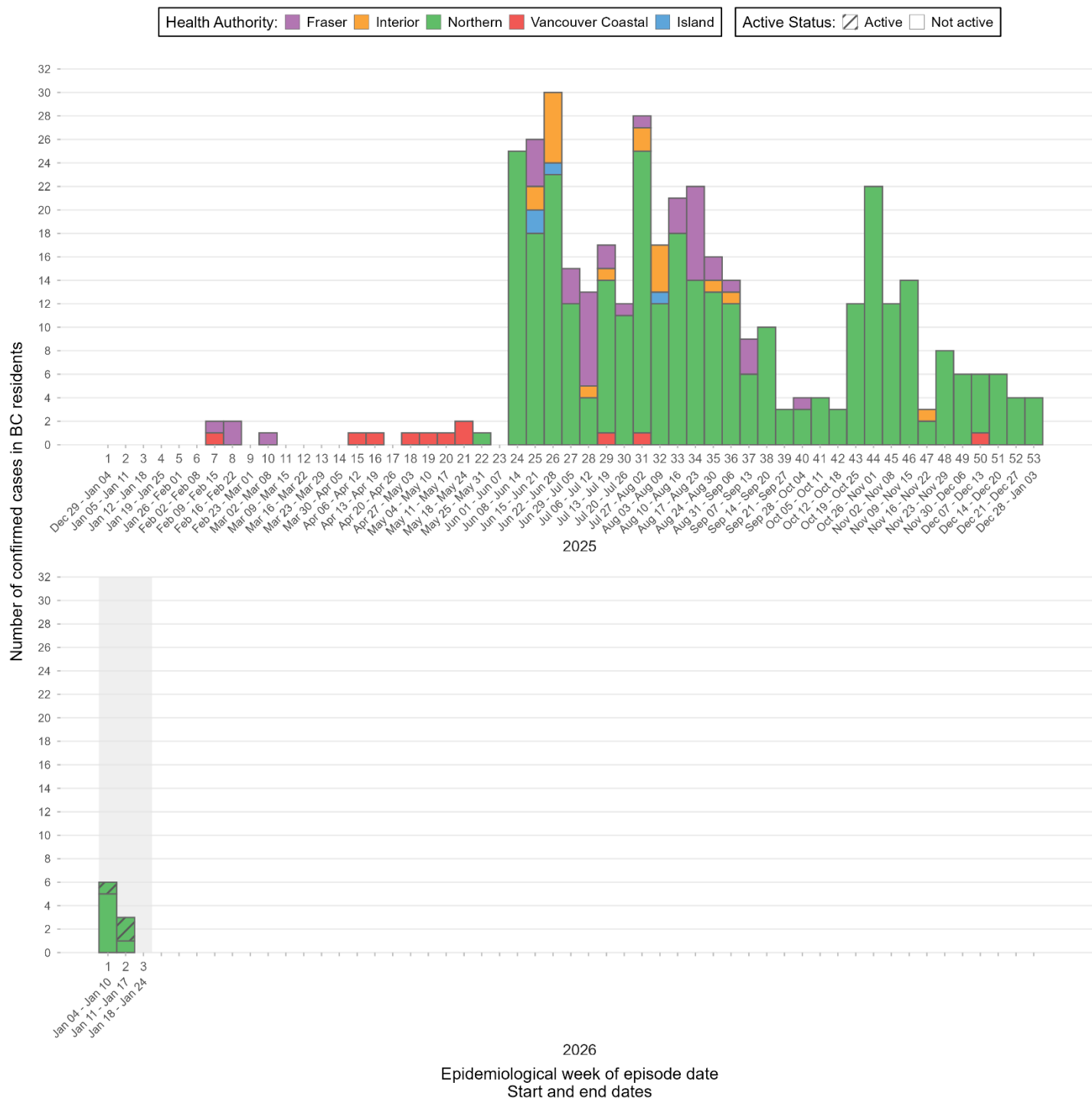
Figure 1. Epidemic curve of confirmed measles cases reported in BC by RHA and active status, 2025 and 2026

Total count = 408 cases reported in British Columbia.