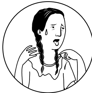
Hot, red, or dry skin