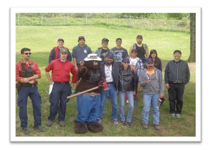
FireSmart celebration in Kanaka Bar, 2019