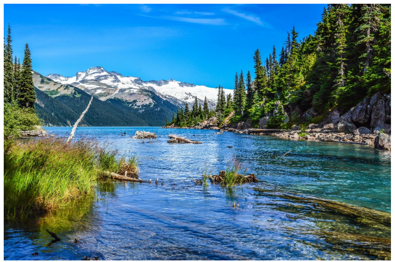
Garibaldi Lake, British Columbia