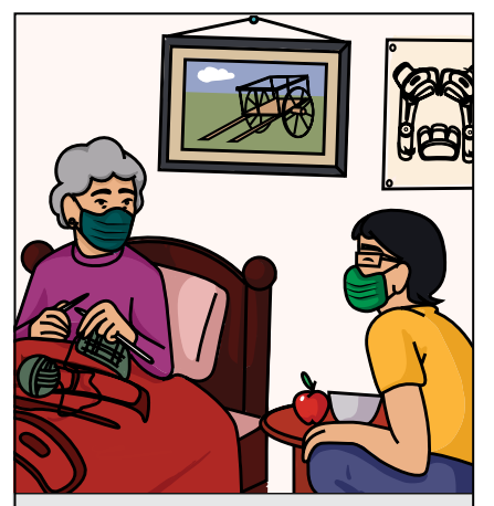
Max and Grandma both wear masks when together.