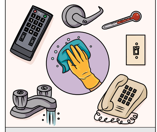
Max cleans objects he or Grandma touch.