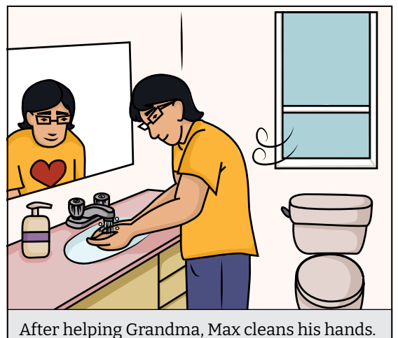
He washes his hands after touching his mask.