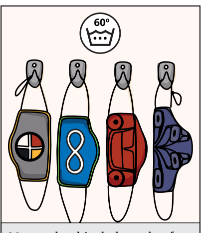
Max washes his cloth masks often. Paper masks are used once.