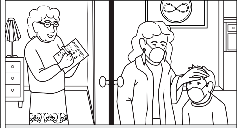
Sam checks with Grandma and kids every day to see if they have symptoms. Everyone cleans their hands often.