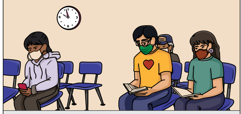
The whole visit will take 45-60 minutes. There is a waiting area before and after Mom's vaccine.