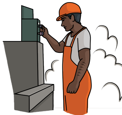
Work exposures to chemicals