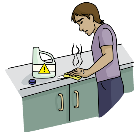
Splashing or inhaling chemicals

DPIC staff will also follow up to make sure you're ok and to talk you through next steps if you need to see a medical professional.