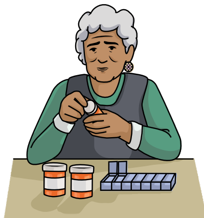
Medication mix-ups and mistakes