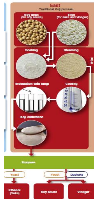
Figure 2. Basic koji process (Zhu and Tramper, 2013) 3